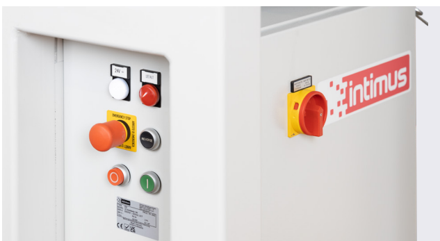
Operation via easy-to-understand push buttons