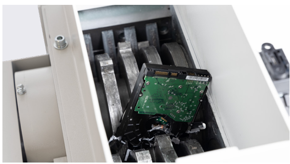
Blades 19 mm wide