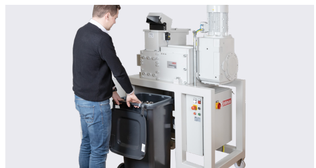
Standard 120 litres collection bin