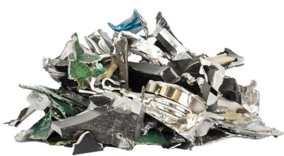
HDD particles Security levels: H-4